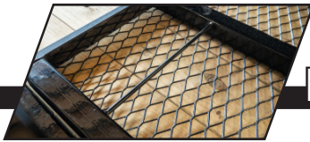
RAMP GRAB HANDLE

*SOME FEATURES CHANGE DEPENDING ON THE SIZE AND LENGTH OF THE MODEL*