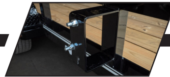
SPARE TIRE MOUNT